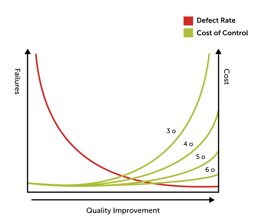
not necessarily the lowest cost producer.

Six Sigma offers a break in the traditional paradigm, where at higher quality levels there is not necessarily a point of diminishing economic returns from investments targeted at improving quality. See Figure 2 below. [1] This is because the quality improvements are not based on inspection and detection of the defects, but on eliminating the possibility of the defect ever occurring in the first place.