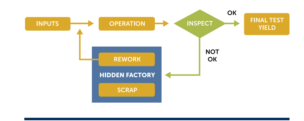
FIGURE III. THE SIX SIGMA HIDDEN FACTORY

the performance after project completion. This difference in metric performance is used to substantiate the claims of improvements related to the project.